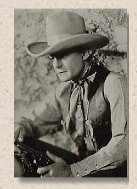
Buck Jones, star of The Desert's Price. He is described in one authoritative movie database as "one of the greats of B-grade Westerns"