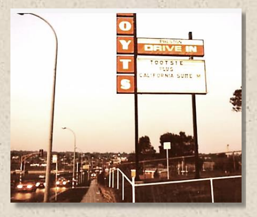
Date uncertain, but "Tootsie" was released in Australia in 1983 - this and the obvious development of Plenty Road suggests the image was taken during the dying days of the Skyline