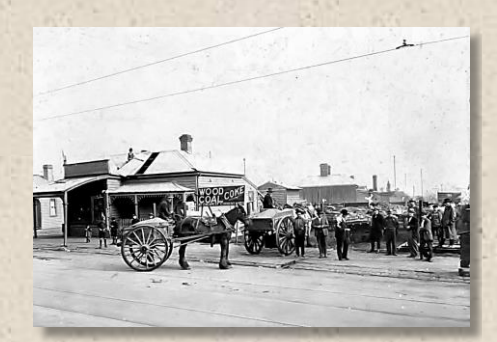
1925. Houses being demolished preparatory to construction of the Gowerville Theatre