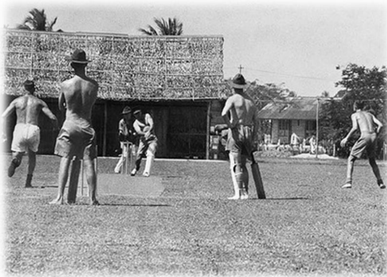
Photo from Australia's War Memorial of cricket playing POWs at Stalag 383