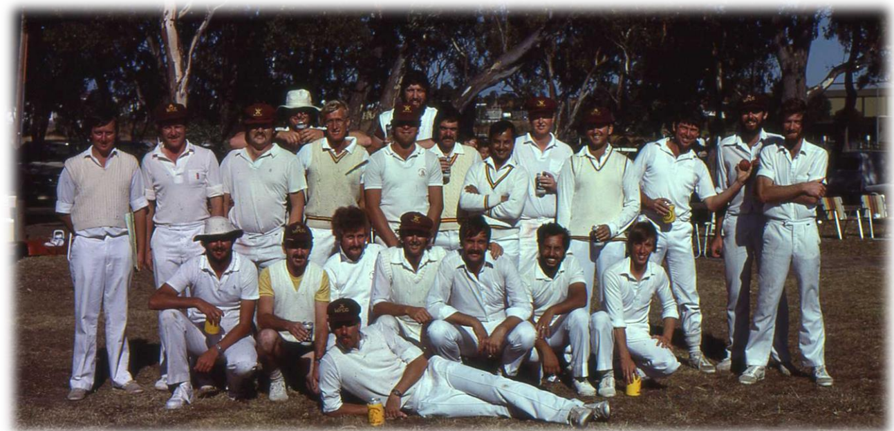
1985-86 2 nd XI & 3 rd XI. Semi Final winners.