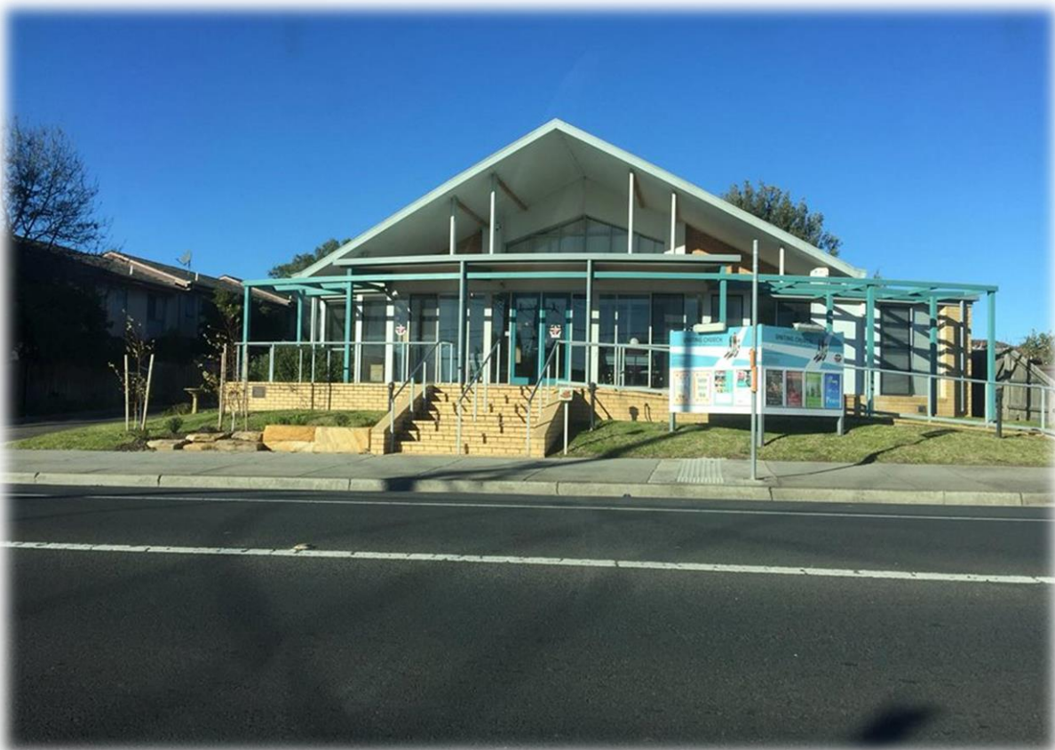
The Church, 2016.