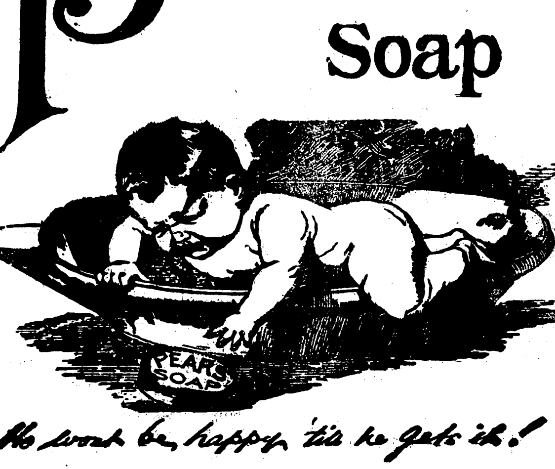
The soap he keeps his hands clean