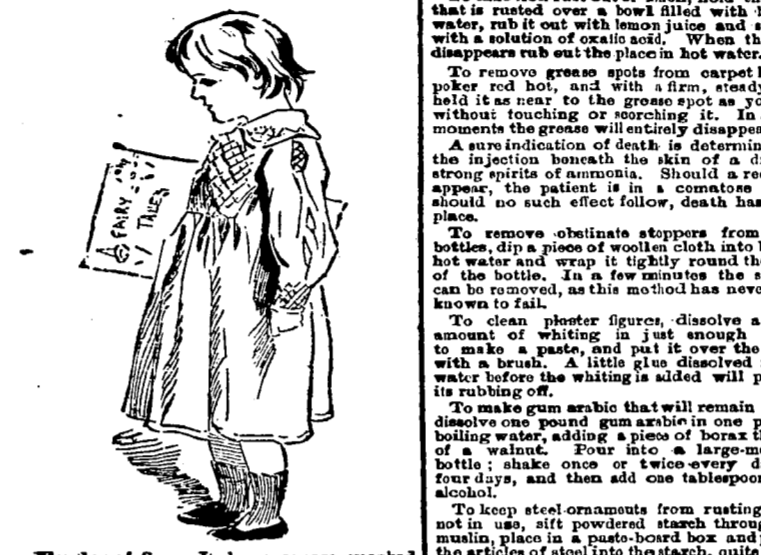
THE ATHLETIC GIRL.

They are not interested in the money itself, but in the influence it gives them.