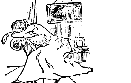
Illustration of a woman sitting at a desk, possibly reading or writing.

THE CHRISTIAN ENTERTAINMENT... A HUGE SUCCESS... Not since the previous State School "Xmas" entertainment has the "Preston" school been so densely crowded.