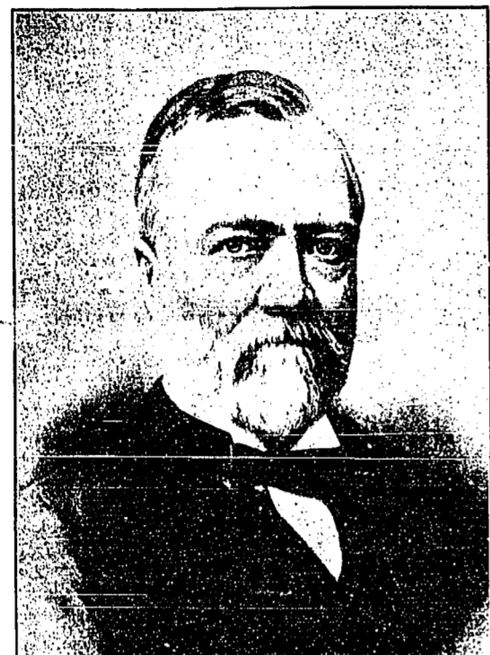
MR. ANDREW CARNEGIE.