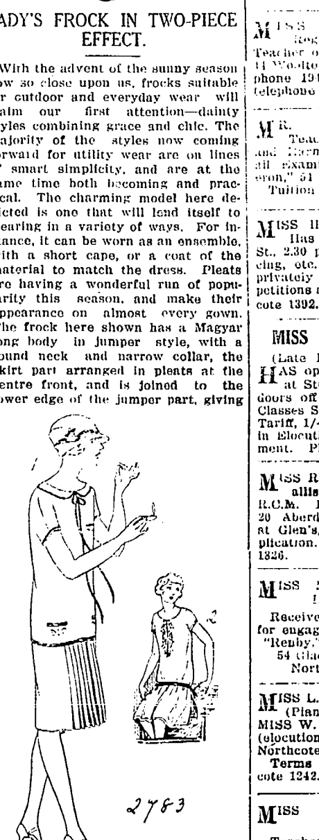
LADY'S FROCK IN TWO-PIECE EFFECT.