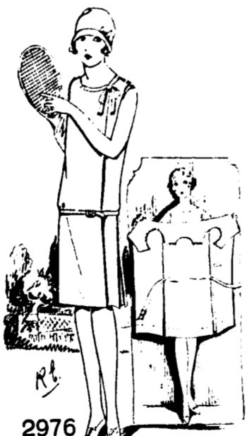
2976.—Now that summer is coming apace, Tennis frocks will be needed. Above is shown a charming design in full, which opens out flat to facilitate ironing. The pleats in the skirt give freedom for quick movement, and the belt finishes the top of the pleats. The sizes are S.W. and medium.

The following patterns were designed in Melbourne for "Leader" readers. They are accurate and can be thoroughly relied upon, and may be obtained with instructions for the small sum of 1/- post free from "Leader" Fashion Service, 309 High Street, Northcote, Victoria. Number and bust measurement should be given when ordering.