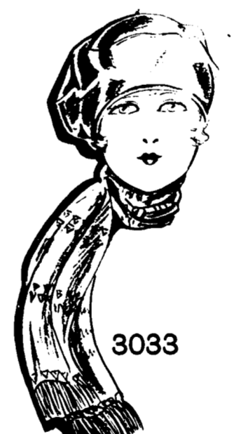
3033.—This smart beret for keeping the hair tidy while motoring or boating may be made to match or tone with the frock. The fancy and vivid scarf is also an attractive addition to your costume. Sizes of head measurement for berets are 21, 22 and 23 inches.