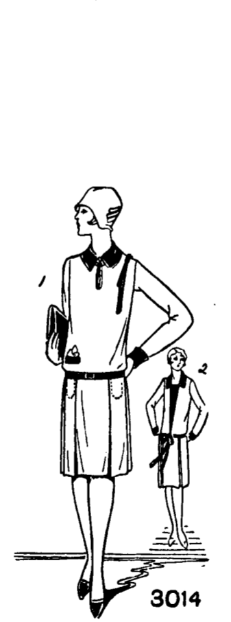
3014.—Here is depicted a simple little frock useful for any occasion, and equally effective in the heavier or flatter materials. Maroon, with a contrasting shade for cuffs, collar and belt, add a daintiness, and the pleats in front give extra width to the skirt. Obtainable in medium and out-sizes.