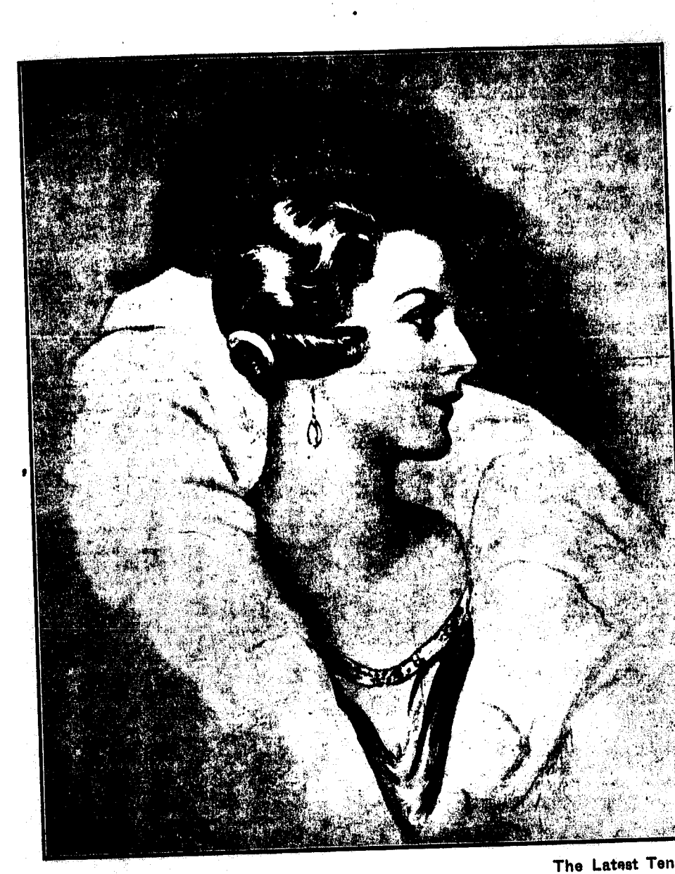
The Latest Tendency in Fashion in Coiffure.

Two blouses in "lingerie" are here depicted—one in crepe de chine, the other in silk, ornamented by a jabot, and by its side, a blouse in heavy, crepe de chine, with lace and tulle in front with a cravat made out of the same lace.