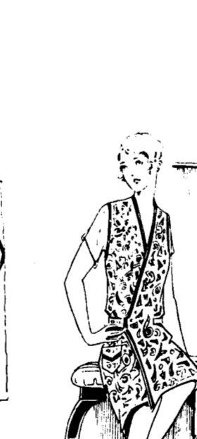
3137.—A handy little Apron or Overall, light for summer and suitable for house wear. This proves a dainty present, either made up in cretonne or linen, bound with a contrasting color, or even gingham would look well. Sizes obtainable are 36-38 and 40-42 inch bust.