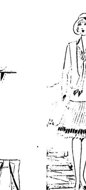
3267.—Here is depicted a Jumper Suit in a very neat design, for medium and outsize. The pleated skirt gives freedom for sport, and the jumper, finished with a low belt, has an inset vest and cuffs of a contrasting shade. This model was designed from white marocain with black trimmings.