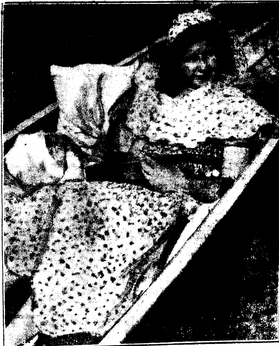
Her charm is her happy abandon to the spirit of carnival, and she exemplifies the color and youthful animation which transformed the river on Saturday.

(By courtesy of "The Argus," Melbourne).