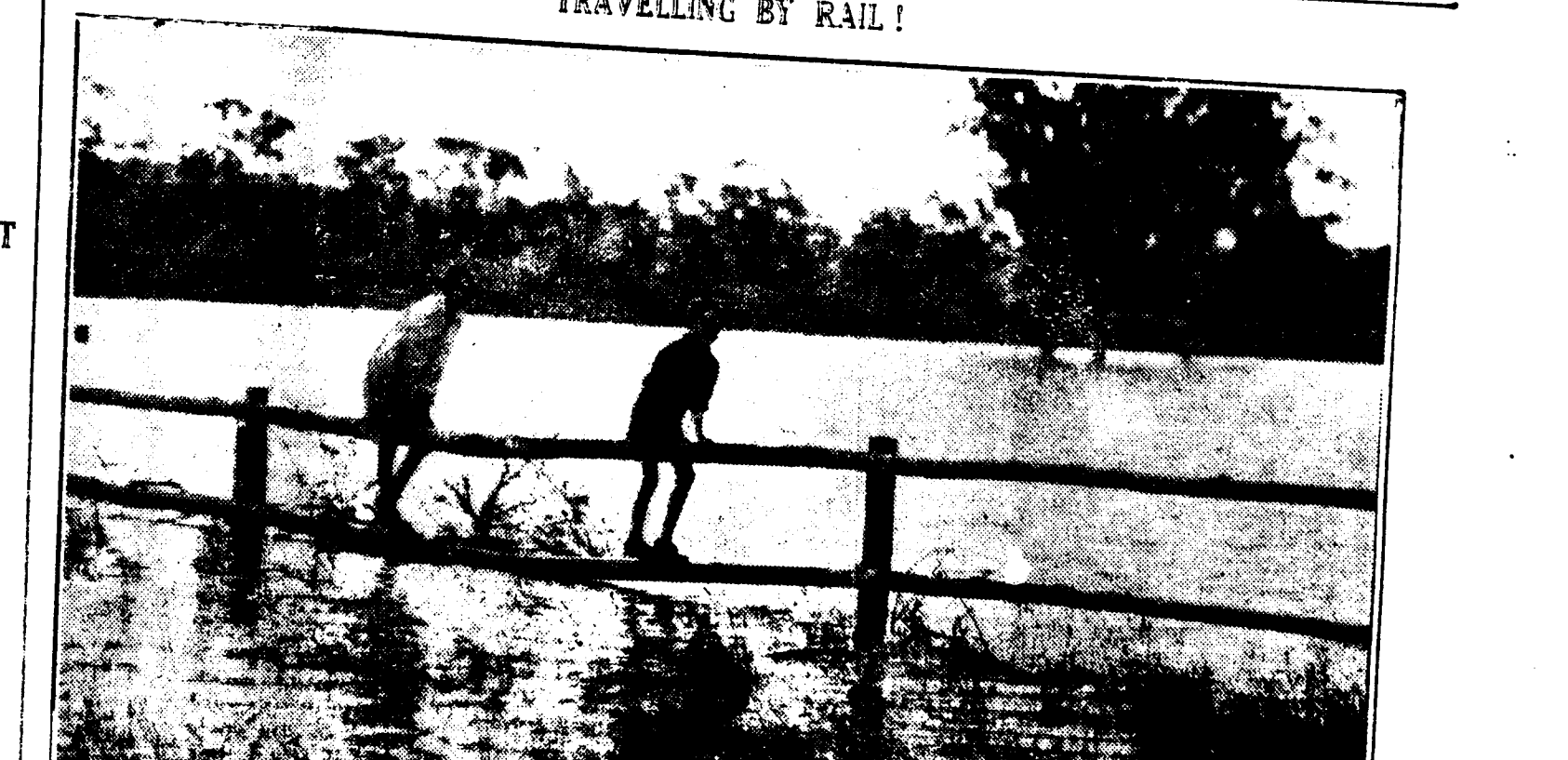
The flooded paddocks on the river flats by the Burke road bridge, Heidelberg, was to follow the example of the boy and girl and slide along a boat and rail fence. A snapshot taken during the recent heavy rains.