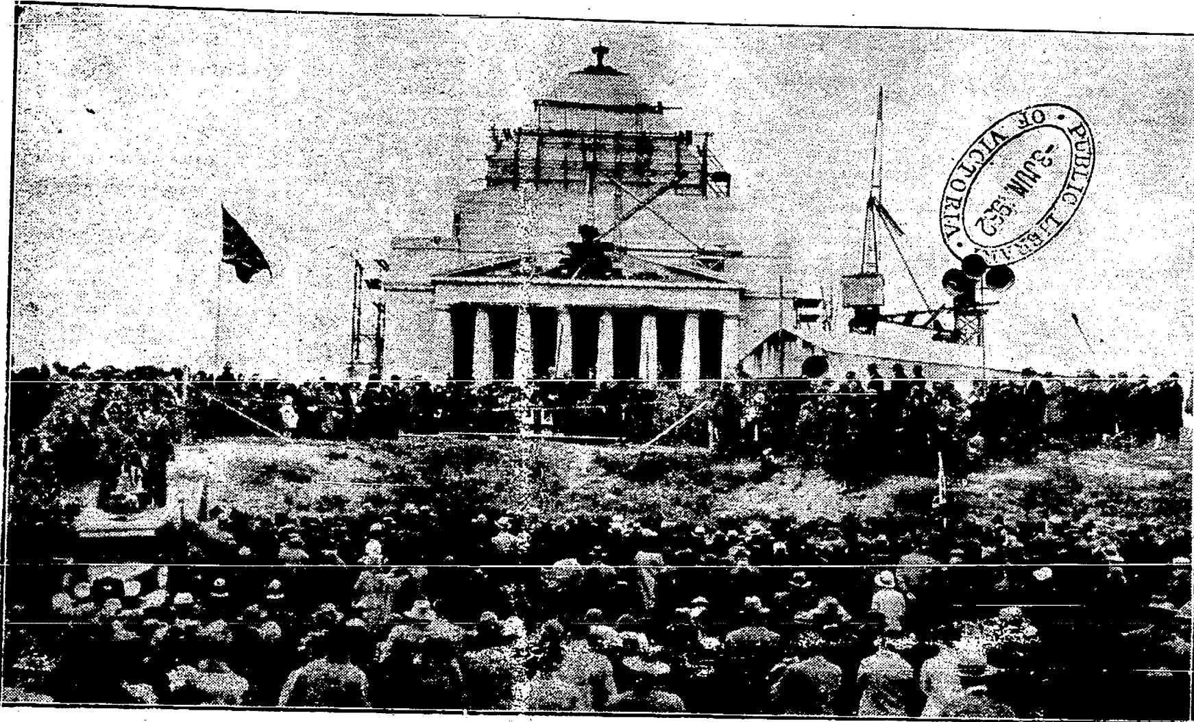
The above photograph indicates the progress made with the Shrine of Remembrance being erected at the Domain, St. Kilda road in commemoration of those who served in the Great War. The photo was taken on the occasion of the Empire Celebrations. When completed, the Shrine will be visible from liners coming up the Bay.