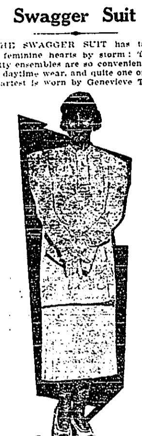
Swagger Suit worn by Genevieve Tobin in the Paramount Picture 'GOLDEN HARVEST'