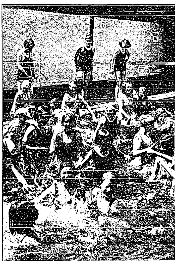
ONE of the most enjoyable methods on spending a hot day.