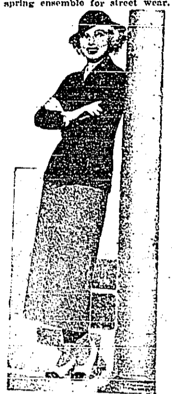
A Spring Ensemble Worn by Toby Wing. A beautiful Paramount Player.