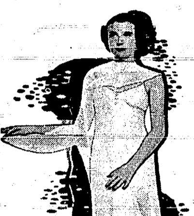
White Net Lace featured by Kitty Carlisle in Paramount plays

THE age of romance has combined with the current fashion trend for evening wear in Hollywood. Kitty Carlisle, Paramount player, wears voluminous gowns of white net lace studded with rhinestones and trimmed with clusters of rose geraniums.