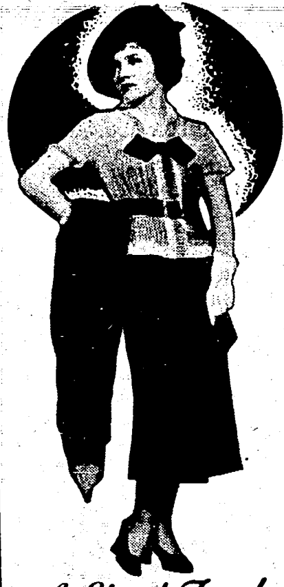
A Street Traction featured by Claudette Colbert in Paramount's A Paramount Player

FOR the hot days of summer, this cool-looking white tucked voile is most suitable.