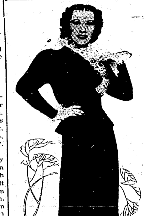
A DAYTIME FROCK, Featured by GLADYS SWARTHOUT of Paramount Star.