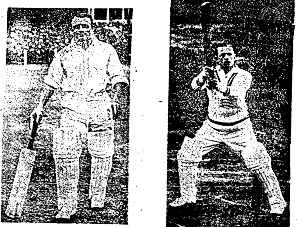
DON BRADMAN, Australia's super-batsman, who will captain the side in the first Test Match. England's probable captain, A. R. ROBINS, who will face a hard task at Nottingham on June 10.