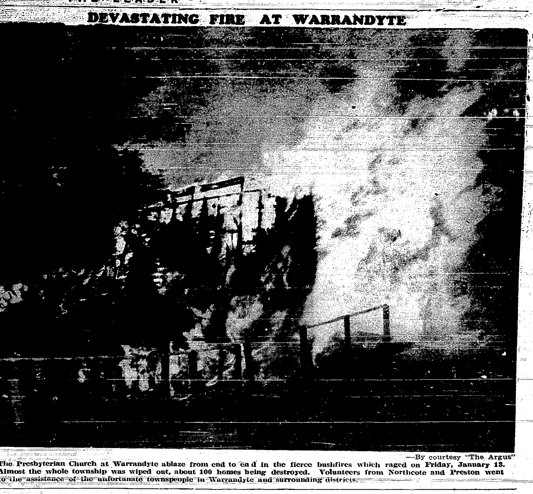
Almost the whole township was wiped out, about 100 homes being destroyed. Volunteers from Northcote and Preston went to the assistance of the unfortunate townspeople in Warrandyte and surrounding districts.

DEVASTATING FIRE AT WARRANDYTE The Presbyterian Church at Warrandyte ablaze from end to end in the fierce bushfires which raged on Friday, January 13. Almost the whole township was wiped out, about 100 homes being destroyed. Volunteers from Northcote and Preston went to the assistance of the unfortunate townspeople in Warrandyte and surrounding districts.