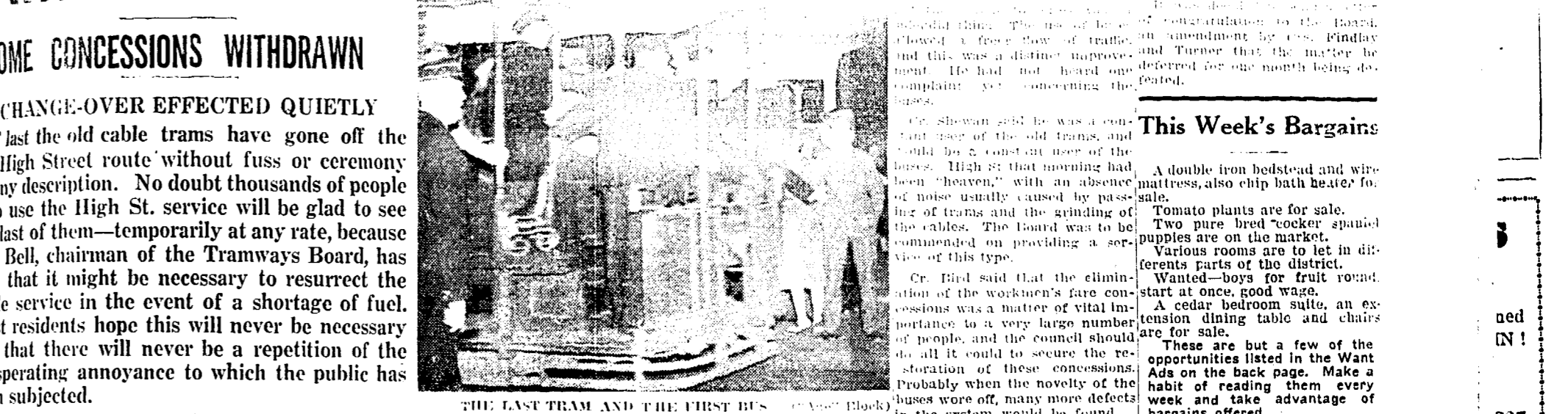
THE LAST TRAM AND THE FIRST BUS