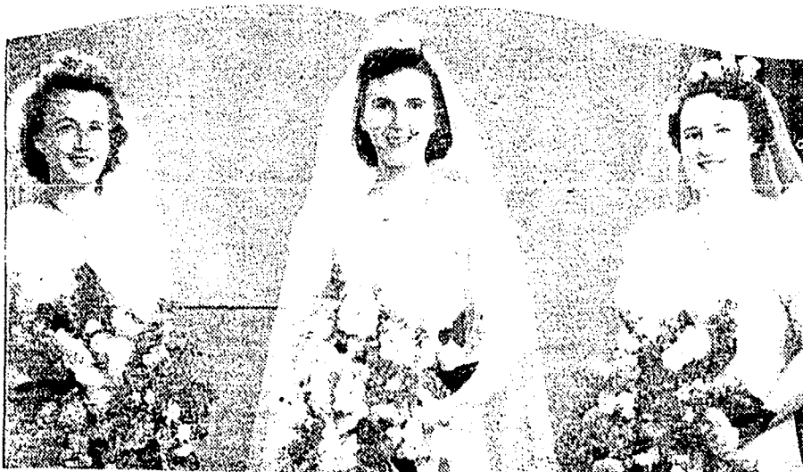
Black features the "Ages" Photo Cyril Stevens Studio.