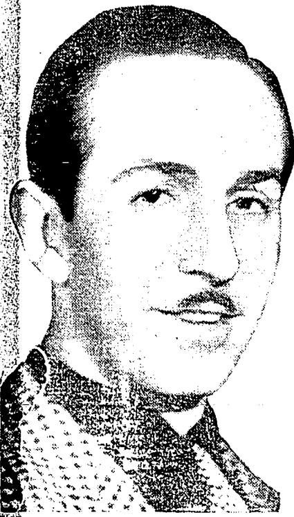
Walt. Disney, creator of "Pinocchio"

FIRST SUBURBAN THEATRES TO SCREEN NEW WALT. DISNEY EPIC