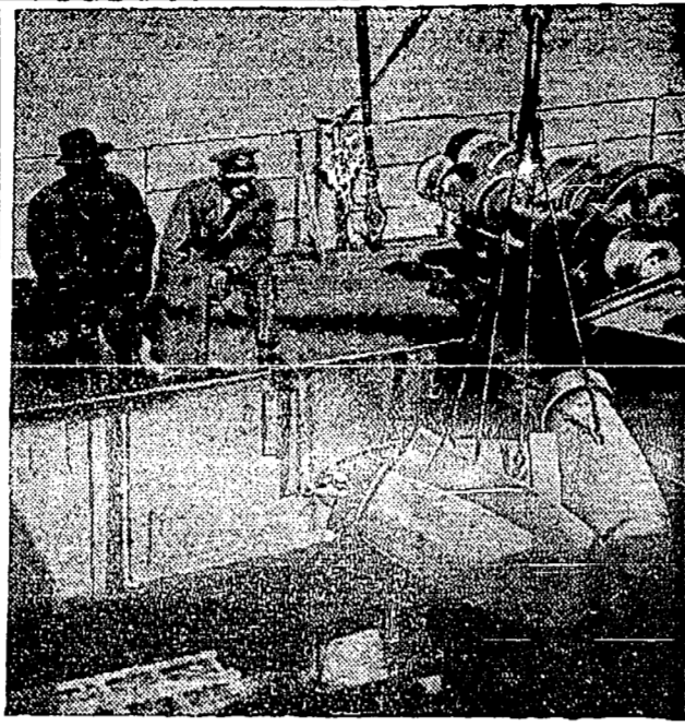
Canada Supplies for Britain Will Help Shorten the War