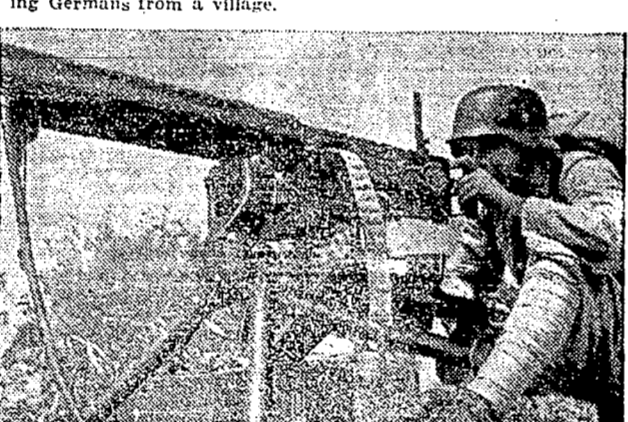
After Five Years of War Against Unprovoked Aggression—China Fights On