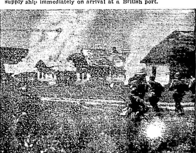
A Red Army Attack in the Crimea—Radioed Picture