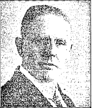
MR. FRANK BRENNAN M.H.R.

SOLDIER NOMINATES AS INDEPENDENT U.A.P. CANDIDATE CERTAIN Present indications are that the sitting member for Batman (Mr. Frank Brennan, M.H.R.) will have at least two and quite probably three opponents at the forthcoming Federal election.