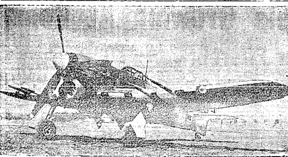
Typhoon: The R.A.F.'s New Demon Fighter

TEED CIRCULATION: 11,000 Office Address: 461 High St., Northcote, JW3780 JOIN YOUR