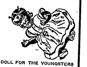
A DOLL FOR THE YOUNGSTERS FOR CHRISTMAS. Now dolls are unobtainable. Advertise now through the WANT ADS on back page of this paper for one for your youngster for Christmas.

WANTED TO BUY: There are more wanted to buy ads on page 2. WANTED TO SELL: A SHOL ELKIR, Hay Fever, and other ailments quickly relieved.